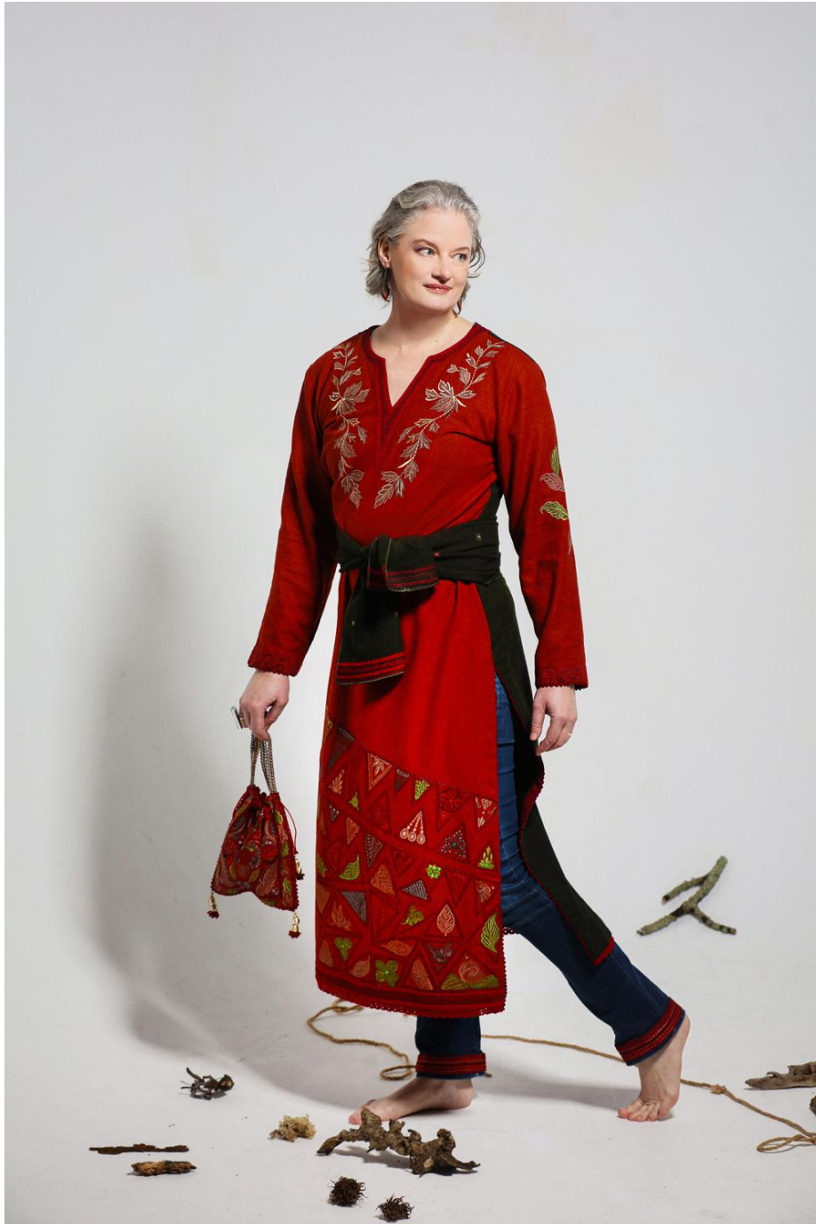
Honestly Greenwashed | Leaves Dress

100% wool · 9-color hand-guided machine embroidery · Orange/rust front · Olive green back · Ensemble: scarf (150 × 32 cm), bag (24 × 20 cm)