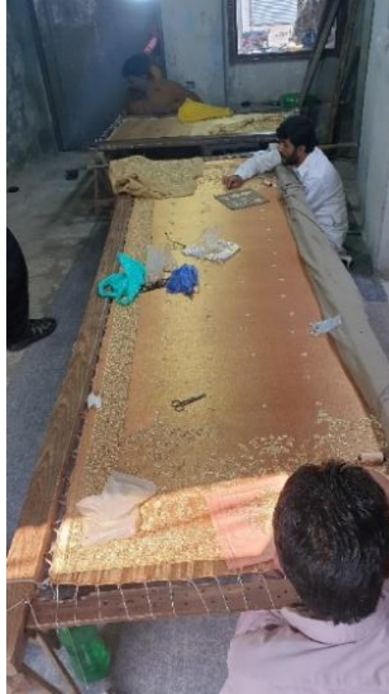
Craftsman working with Aari hook

Traditional Pakistani tambour embroidery is executed with a hook-shaped tool (the Aari hook) and requires years of training. The technique allows for extraordinary precision and density — creating surfaces of exceptional richness that cannot be replicated by machine.